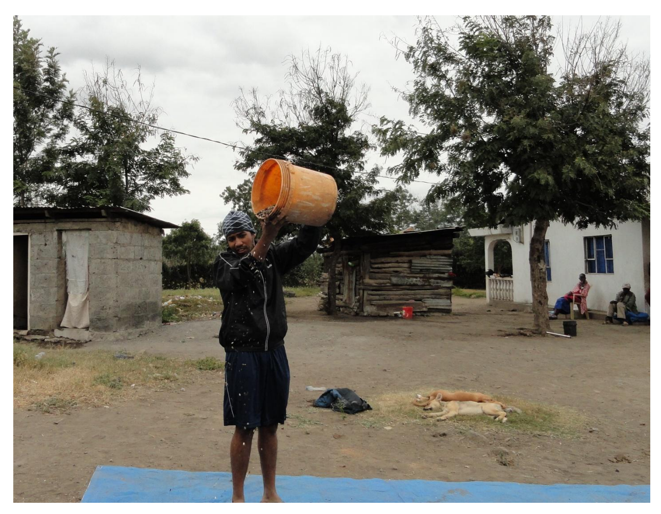
Team trying out the conventional process of cleaning sunflower seeds from the chaffs

After coming back from the community, all of us took turns in identifying the problems, we observed during our stay. Another topic of discussion, was the delivery mechanism – how do we implement innovation in education?