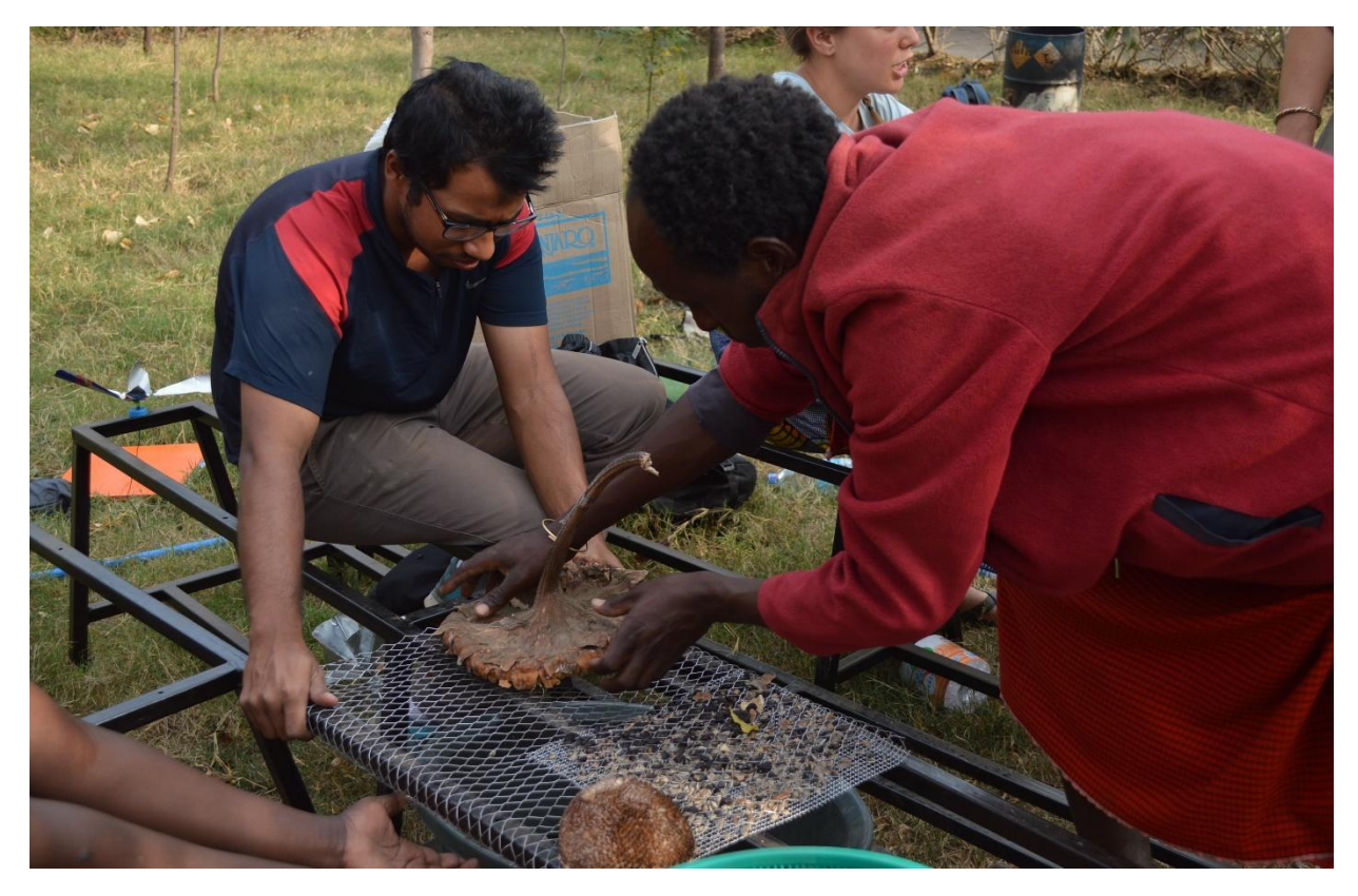
Team working with the local community members