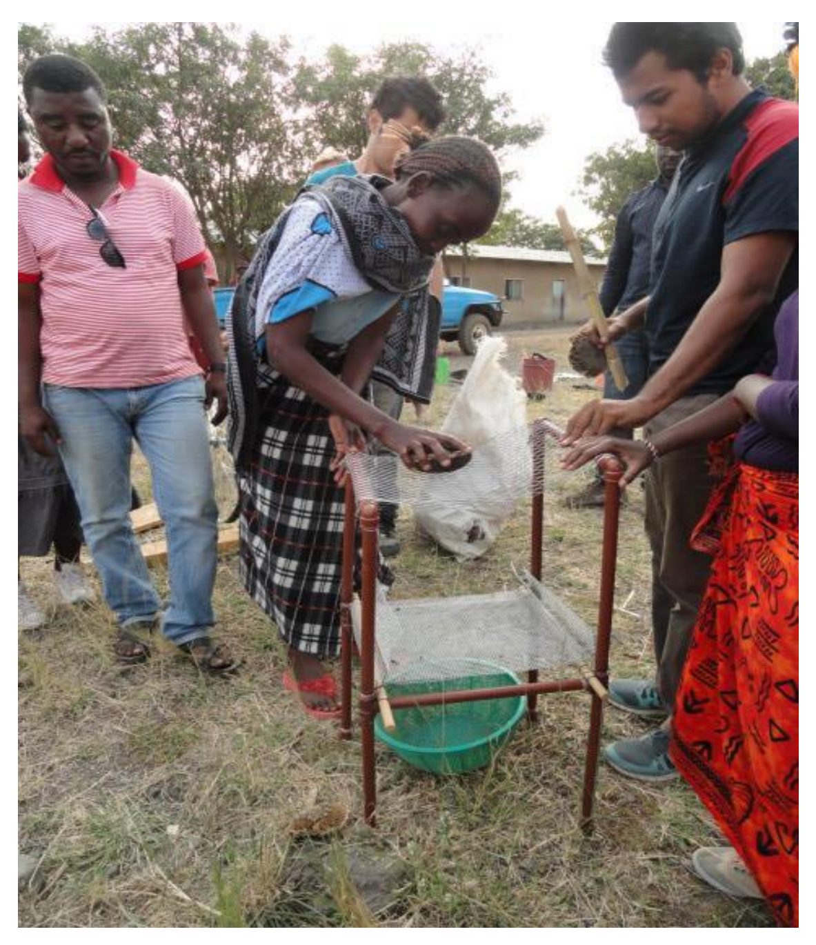
Women in the community trying out the machine