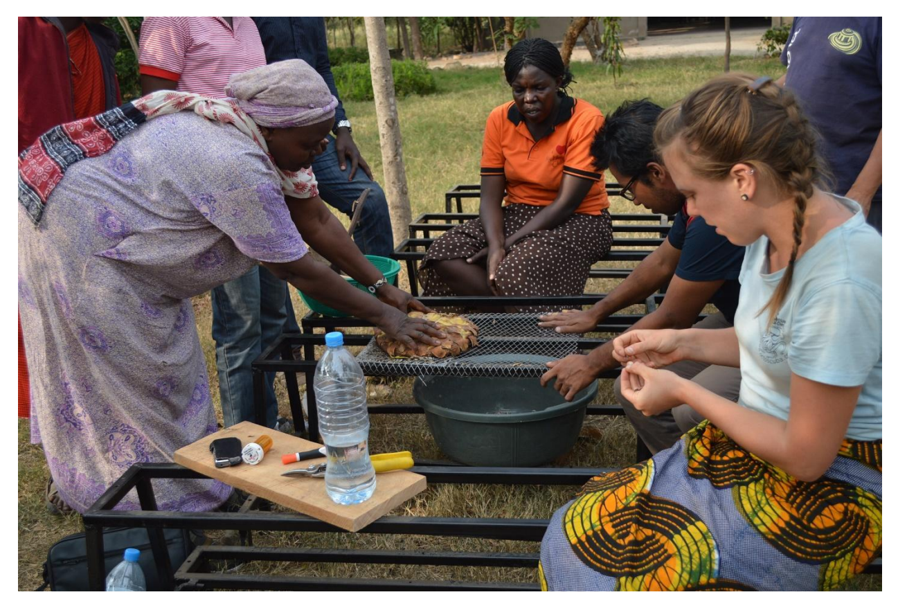
Co-creation: team building the prototype in Orkolili Secondary School

Once we narrowed down the scope of work, we initiated prototyping, experimenting and building our prototype along with the local people in the community as part of the co-creation process. We built our prototype in Orkolili Secondary School. This helped us to get constant feedback from the users and we realized that we progressed much faster during the co-creation process than when we were trying to do it by ourselves. It also ensured that we assumed less and asked more questions to the users of the product. Even though we started building the prototype to address the problem of only cleaning the sunflower seeds from the chaffs, the final product included both threshing of the seeds from the sunflower cake and also cleaning of seeds. The fact that we looked at the problem from various perspectives and went back to the beginning of the process, helped us to build a much better solution.