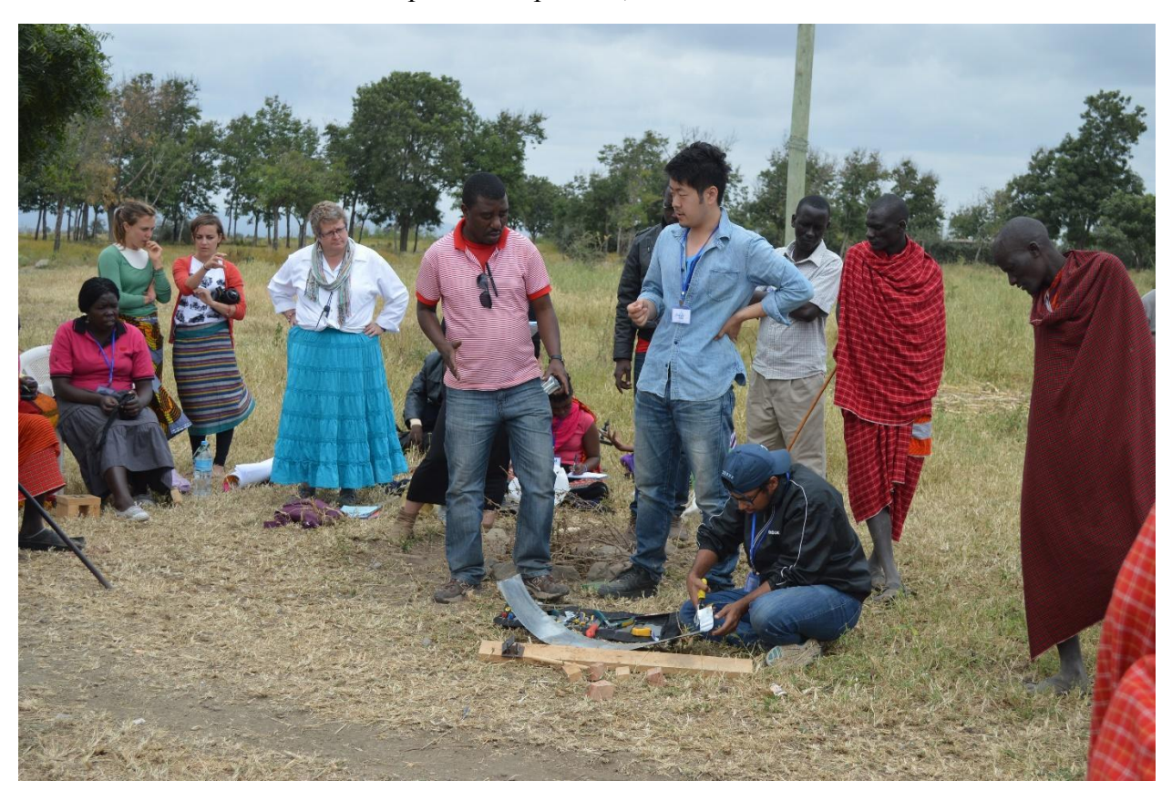
Team performing the corn sheller build it in the community meeting

keen interest of the people in the product. This helped us to get the members to open up with the team and also to observe their response to a product, which was useful to them.