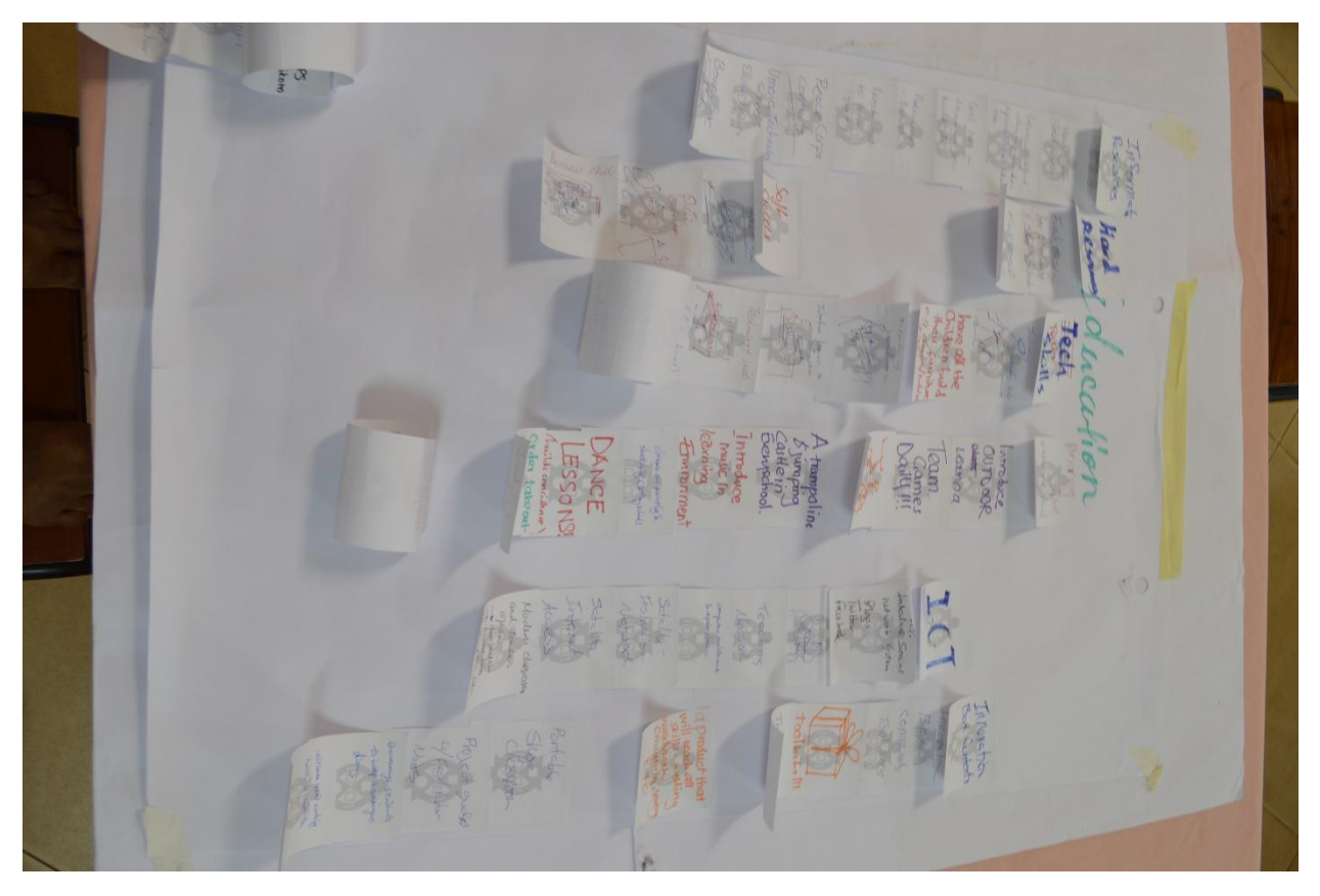
All the members of the team listing out the problems they felt in the community

After a series of discussion within the team, we decided that we wanted to provide local school leaders with an innovation tool- kit that will equip them with all the necessary information and technical know-how to implement the project in the school. The innovation tool- kit will consist of