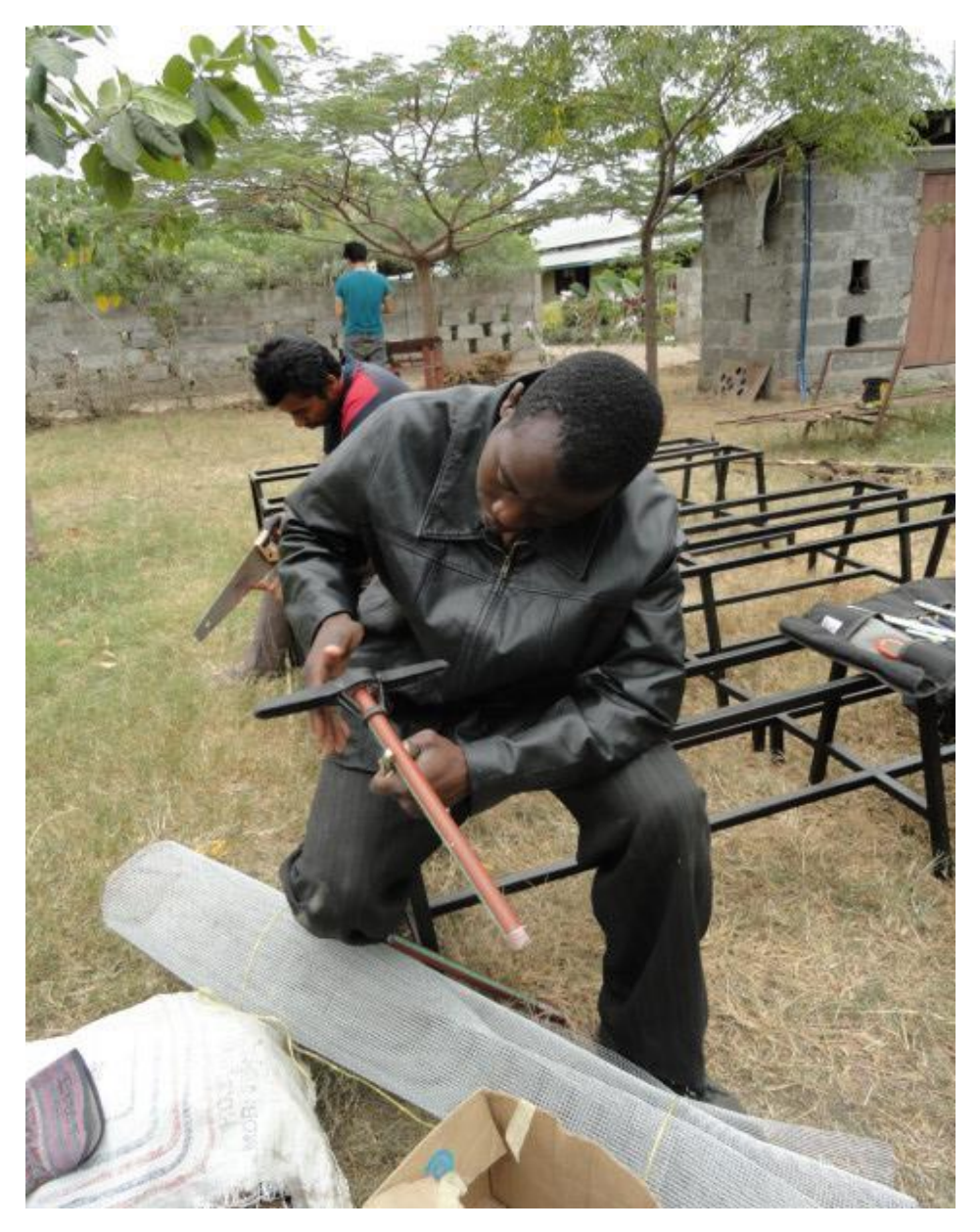
Trying out meshes of different sized holes

Then, we saw a chicken mesh at one of the Maize flour shop, used to clean the maize seeds. We brought some sunflower cakes to test on the mesh by rubbing it against the mesh, and even though it worked to remove the seeds from the cakes, it was more tiresome than the usual hitting process. We, experimented the same process on a mesh with bigger holes and this time the process was much faster than the earlier process. Using this as the starting point, we created another layer of mesh at the bottom to collect the seeds and also filter out the smaller chaffs, which did not get blown away by the wind. The bottom mesh has smaller holes than the upper mesh to not let the seeds fall down.