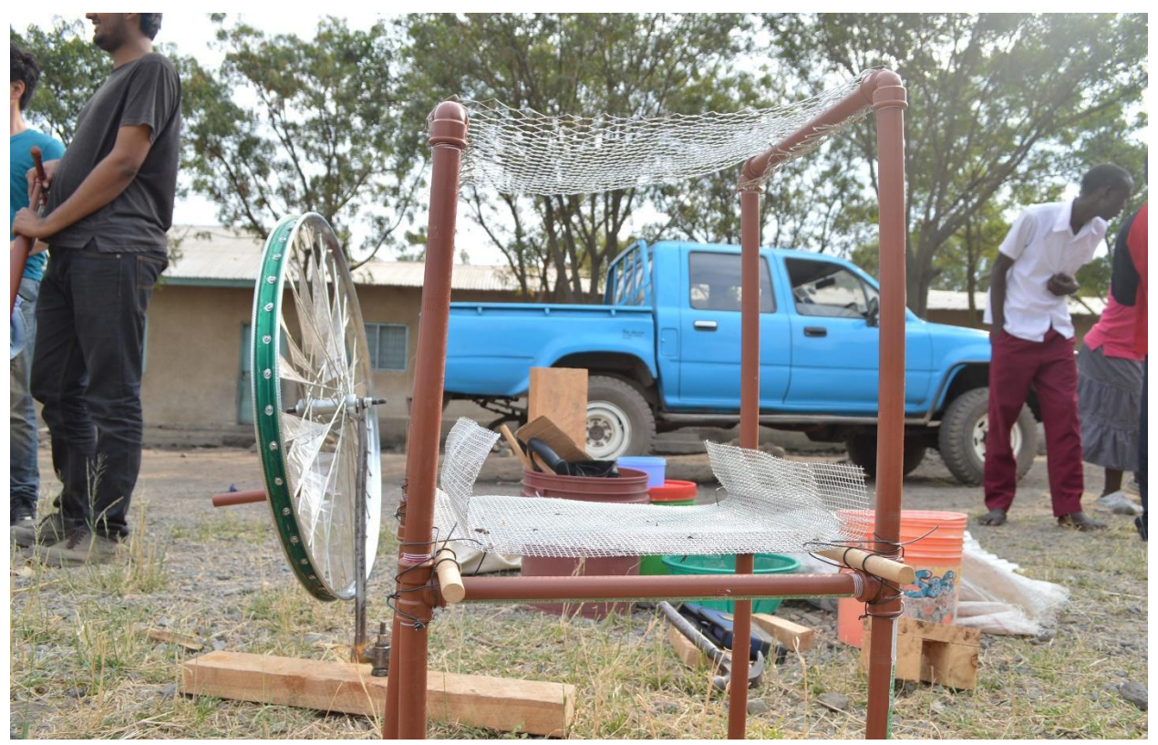
Prototype version I