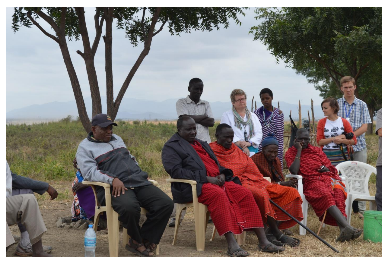
Community Meeting in Orkolili

The team worked with a local school in the village of Ormolili to gain a better understanding of the education system in the entire community.