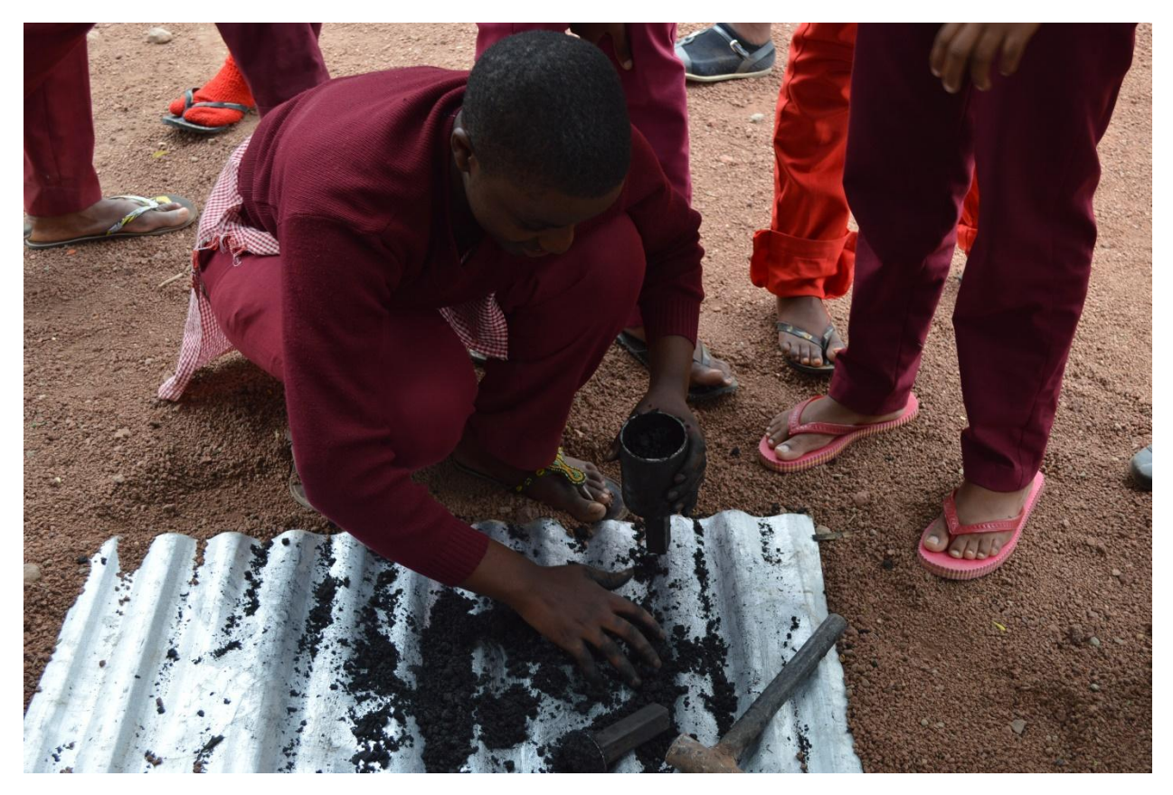
Team teaching the students of Orkolili Secondary School how to prepare charcoal from agricultural waste

integral part of the hands on curriculum also focus on building critical thinking and soft skills, eventually used to solve problems faced by the community in daily lives.