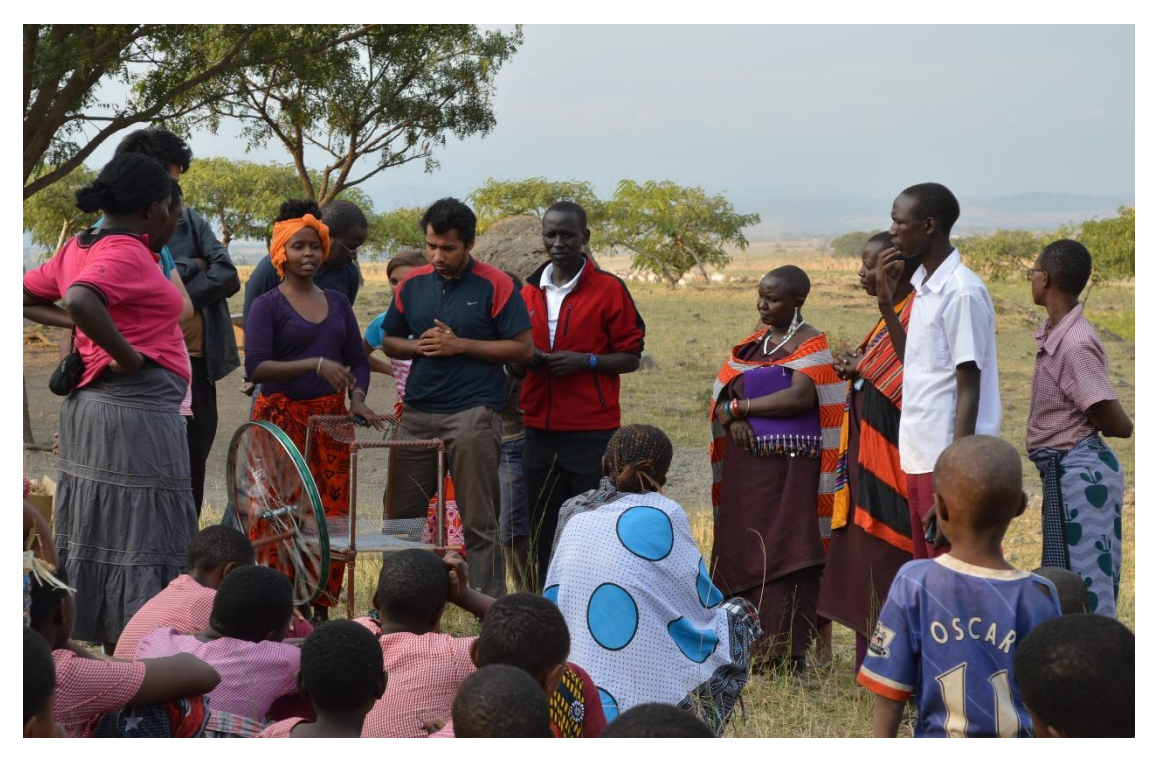
Meeting with the women's group

After we built the first prototype, we not only demonstrated it to various communities but also let them try the prototype to receive first hand user feedback. The various sections of the communities who tested the product were – Students, local leaders and the women groups