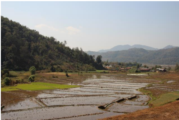
Royal Hills trekking photo

travel agency, which she also had encouragement and inspiration from her brother to do. Beyond just providing tourists with choice and safety though (also in the way that she would be able to contact the tour guides in the mountains in case of emergency and have daily checkups that everything is going all right – especially important in times where rebels fight the Burmese army in some secluded mountain spots), the travel agency also protects the tour guides themselves. The only spot where the tour guides were likely to get customers was the town’s previously single hotel, owned by the corrupt mayor. The mayor then discriminated against some tour guides and even threatened them. He also created contracts for some tour guides to be able to only go to his hotel, and for the rest he wouldn’t allow them any customers, even if they were famous and experienced. So by working through the travel agency, they are also guaranteed a fairer share of customers and wages. Phyu Hsin Win’s agency is also very successful and has much business from travelers that want to plan their trips with more security – not just in terms of personal safety, but a guarantee of what they’ll be doing and where they’ll be going that they know they would enjoy, and skipping all the time at the beginning involving finding a tour guide and planning a route. She also collaborates with travel agencies in Mandalay and Yangon, and many existing tour guides and hotels in the town for this enterprise.