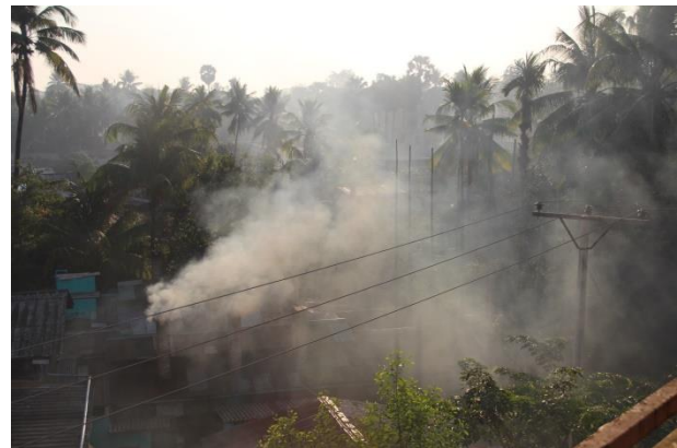
Trash burning in the evenings

I had a short time thereafter stumbled upon a learning-living community at MIT centered around the theme of international development, that also encouraged its inhabitants to create such projects. I then refined my ideas of my project and made it more concrete. Despite having no real experience in this field, I felt very passionately about the issue and worked diligently on creating an approach to the issue. I took classes at MIT's D-Lab (Development Lab), which has diverse classes on the topics within international development, including waste. I had determined it was best, due to the scarcity of available information related to this issue online, to scope out the area for myself and conduct an analysis of the various aspects related to the issue, including stakeholders, waste path, and waste composition. My project partner and I gained much important information this way, and were then able to formulate an additional implementary project that summer. As we had determined the issues to be a combination of education and infrastructure, the implementation phase in June 2014 consisted of an awareness campaign targeting mostly students, but also including a public river cleanup event, and