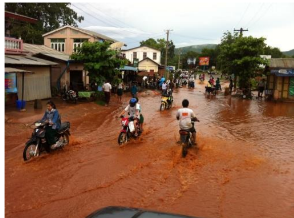
Flood in June 2014

Corruption extends to all matters of government. In Kyaukme, the mayor is infamous for lavish corruption and the funneling of public money into his private expenses. As the owner of a hotel (among many other businesses), he crushed out competition through both intimidation and the revokal of other hotels’ licenses, including his own cousin’s. The planning of the town landfill was similarly laced in corruption. The space was reserved for 5 acres of land, yet the now-overflowing landfill, extending onto both sides of the streets around it, is clearly much less than this, and it is believed the official responsible for its planning sold 4 of the acres to the farmers of the surrounding fields. As corruption pervades almost every aspect of public life and the memory of a police state surveilling words and actions – still in place merely a few years ago – haunts, the