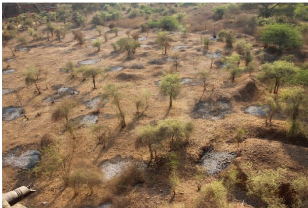
Trash burning spots in historic Bagan

I personally first became acquainted with Myanmar in February 2014, during which time I visited the country as a tourist. The country left me fascinated but also concerned, as the people live under oppressive and unsanitary conditions. I was shocked by the inability to deal with such a simple societal need in Myanmar as waste disposal. I saw rivers unrecognizable from landfills under their coating of debris, gargantuan piles of trash near public facilities such as train stations, and the reliably constant smokestacks of trash burning in the evenings that pervaded the air around with their choking fumes and clouded the sky to Burma's famously beautiful sunsets.