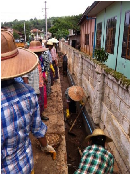
Volunteers at the river cleanup