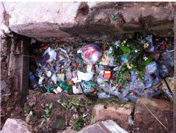
Town drain with litter

In general the infrastructure in Myanmar is quite poor as compared to countries in that region. As the military junta ruling for 60 years was more preoccupied with personal wealth than national wealth and welfare, most infrastructures, especially in the ethnic provinces away from the central Burmese ethnic division, crippled and stunted. One woman in Kyaukme recalls “When I was a child, there were not so many mosquitos. The drains were very deep.... But after Ne Win [military dictator the staged the coup d’état to gain control of the country] took power, the drains are not cleaned.” There are drain cleaners employed by the government in the towns, but lower levels of government work is not seriously taken and government employees come sporadically and for only a few of their hours. Supervision is equally unreliable and bosses themselves take off in much the same way. Now the drains in the town are almost full with plastic packaging, mud, weeds, and various other obstructants. Because of this, during the rainy season they often prove infective against flooding, the prevention of which was the original intention of the drains.