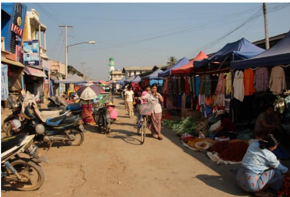
Outside of the market in Kyaukme