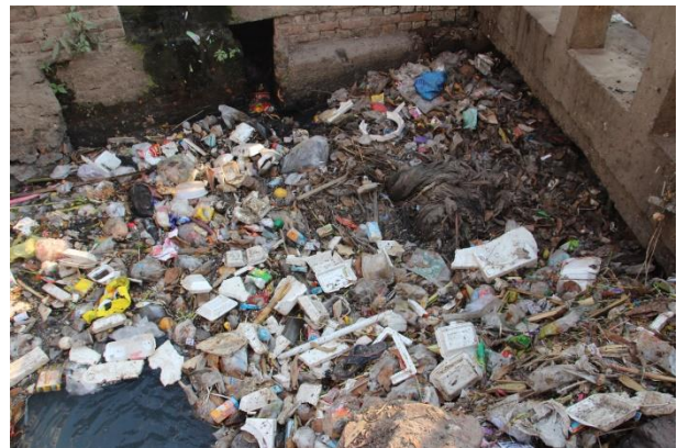
River canal filled with trash