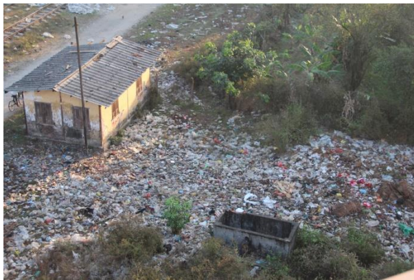
Informal dumpsite near a train station

Myanmar is struggling with many issues as it ascends to the playfield of more open international trade and a loosening of the totalitarian military regime. One of these that caught my attention is the waste problem. According to a UN committee, Myanmar had only 2 landfills in 2005. There are no separated recycling bins, and recycling is done mostly by poor recycling collectors that pick the recyclable items out of piles of trash. Many plastic packaging articles have infiltrated the market as especially China and Thailand take advantage of easier trade possibilities to Myanmar. Yet there is simply no end-stream for these kinds of materials, which always end up burnt or as litter. Yet burning plastic releases one of the most poisonous toxins known, dioxin. And due to plastic's nature, it cannot be broken down easily, and first splits into smaller pieces when in contact with light, aggravating the problem as the plastic then spreads more easily up the food chain after ingestion by river creatures, and dispersed across the soil. Just 20 years ago the people of Myanmar were accustomed to solely organic packaging materials, and the habit of tossing had no negative consequences. A sudden influx of modern goods crashed this biological cycle, and left Myanmar people without any comprehensive solutions.